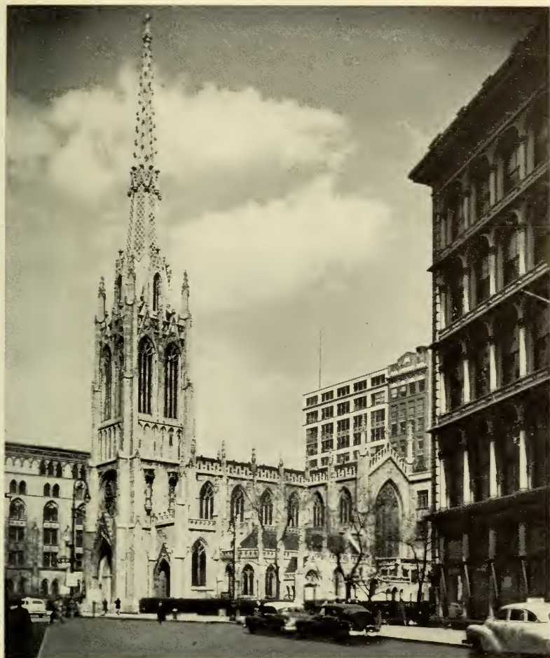
23. GRACE CHURCH