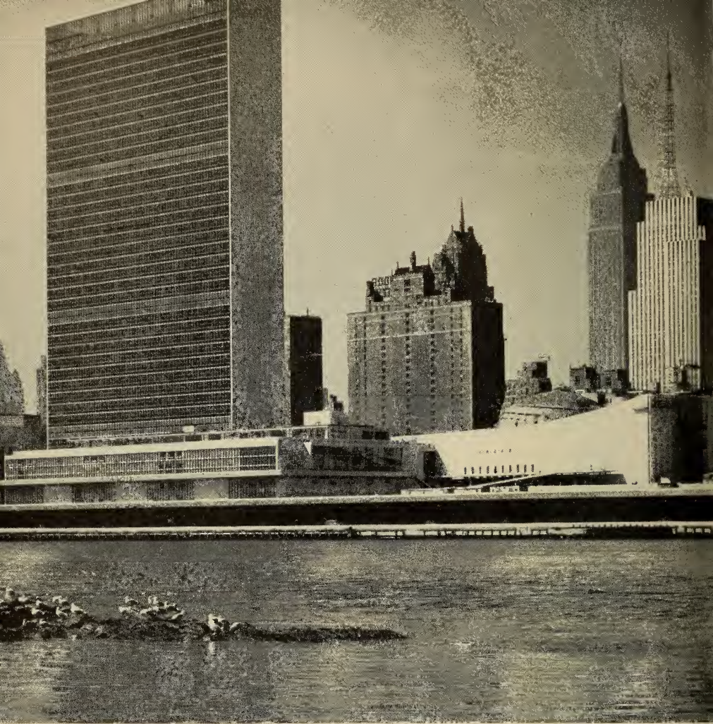
36. UNITED NATIONS HEADQUARTERS: Midtown Manhattan (Gottsocho-Schleisner)