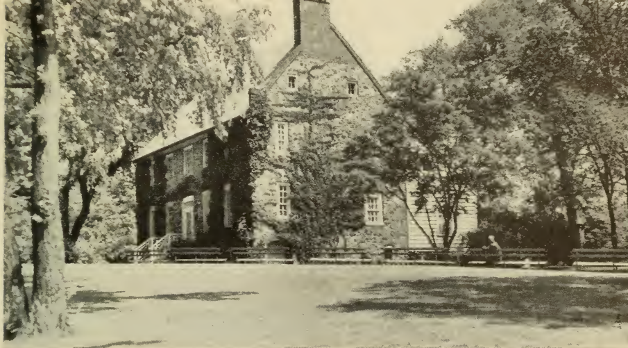
128. BILLOP HOUSE: Staten Island (Conference House Association)