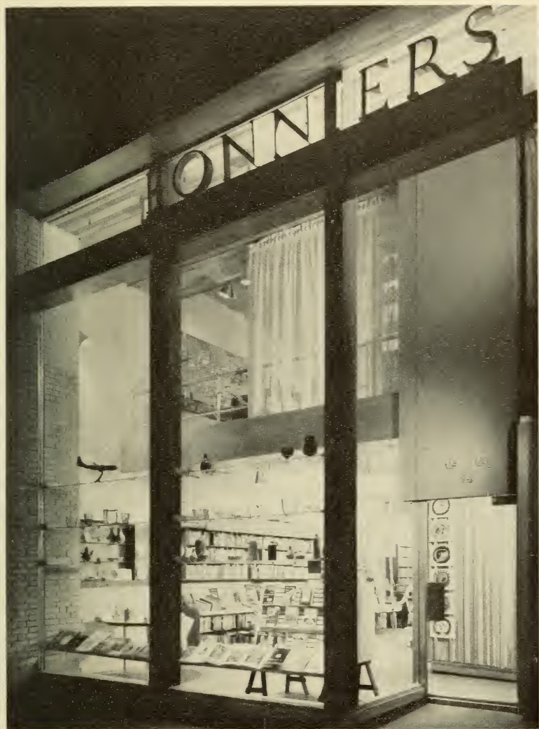
63. BONNIER'S: Manhattan - Midtown (Lionel Freedman)

pleasant downstairs lounge equipped for serving coffee and soup for regular performances and holding buffet luncheons for special groups. A glimpse of the lounge is afforded from the street through the glass front of the lobby and the open stairwell. The gay wallpaper in stairwell and lounge is a Steinberg design. The office building in which the theater is located is by Emery Roth & Son.