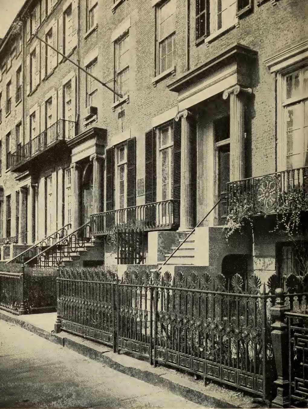
15. WASHINGTON SQUARE HOUSES: Lower Manhattan