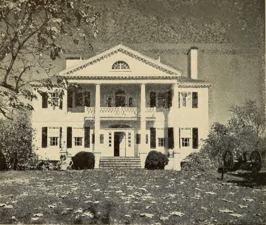
76. JUMEL MANSION: Uptown Manhattan

the site of a fortification of the Revolutionary War. The 62 acres, landscaped by Frederick Law Olmsted, the younger, were given to the city by John D. Rockefeller, Jr., in 1930. The Cloisters, also Rockefeller-financed, is a branch of the Metropolitan Museum of Art devoted to mediaeval European art. It presents exhibits in an atmosphere approximating that of their original surroundings. The large rambling stone building, built in a style reminiscent of the Romanesque, has incorporated parts of five French cloisters ranging in date from the 12th to the 15th centuries. There is also a chapel from a 12th Century church. Smaller fragments from old buildings such as windows, doorways, columns, and decorative members are incorporated in the structure. Except for the cloisters themselves, the effect is scattered and fragmentary. Nevertheless this is one of the few places in America where one can get some impression of the spirit of mediaeval architecture.