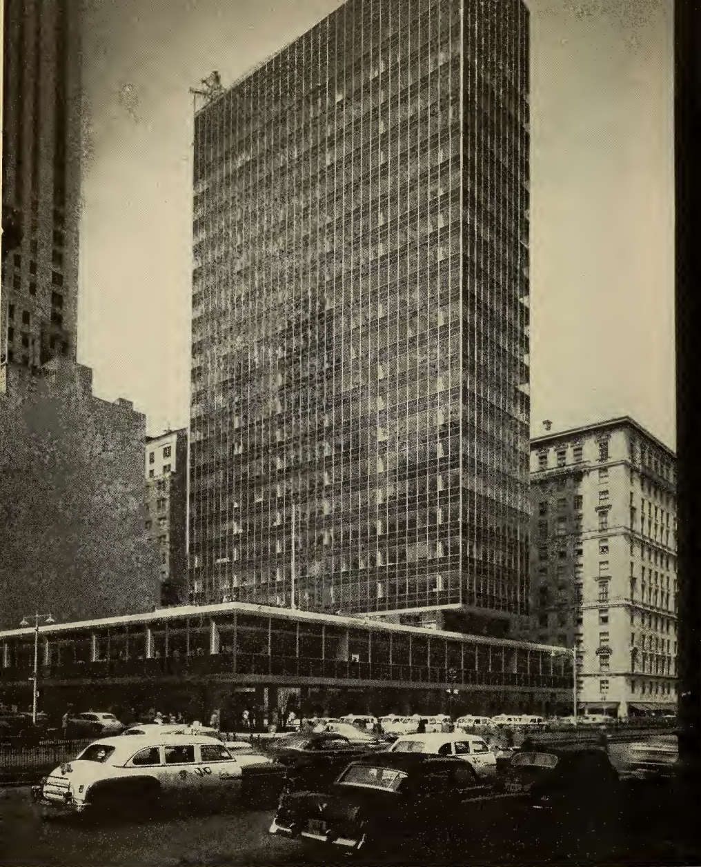
54. LEVER HOUSE: Midtown Manhattan