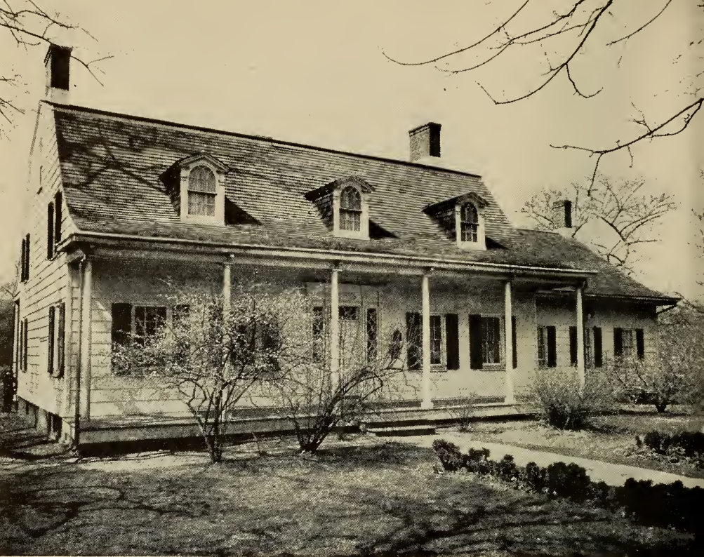
107. LEFFERT'S HOMESTEAD: Brooklyn