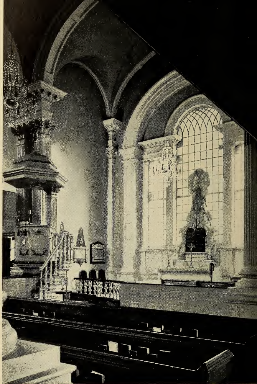
5. ST. PAUL'S CHAPEL: Lower Manhattan