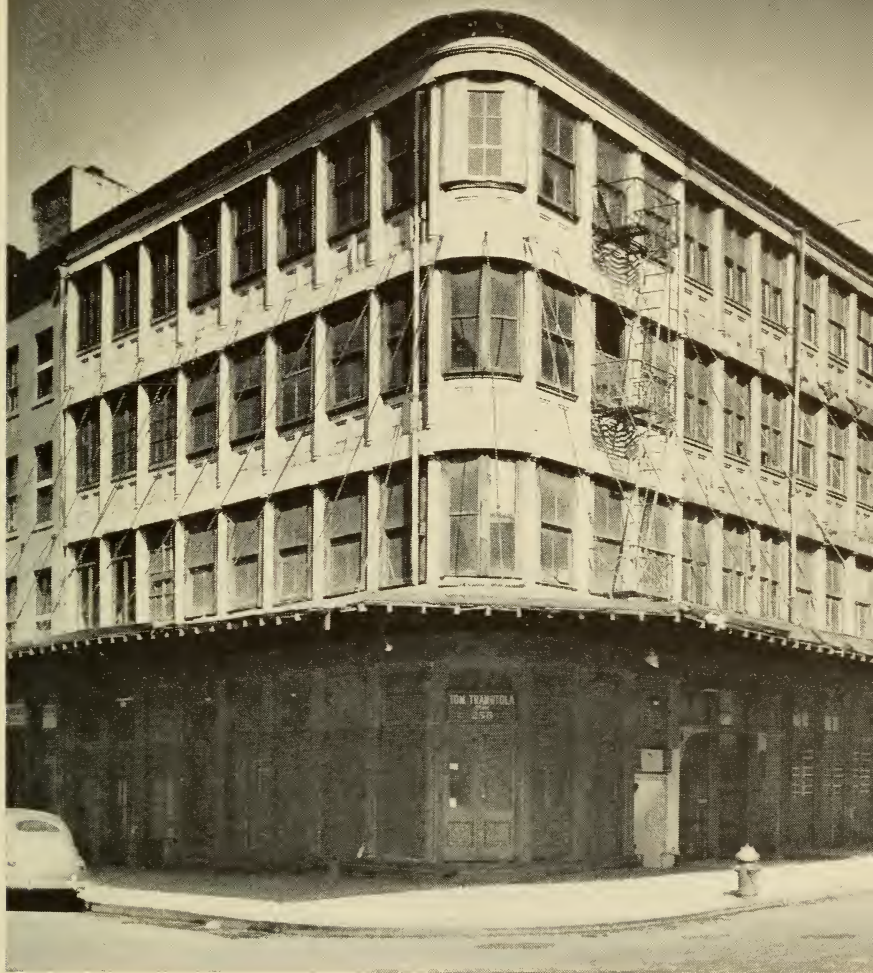
6. CAST-IRON BUILDING: Lower Manhattan (Gottscho-Schleisner)